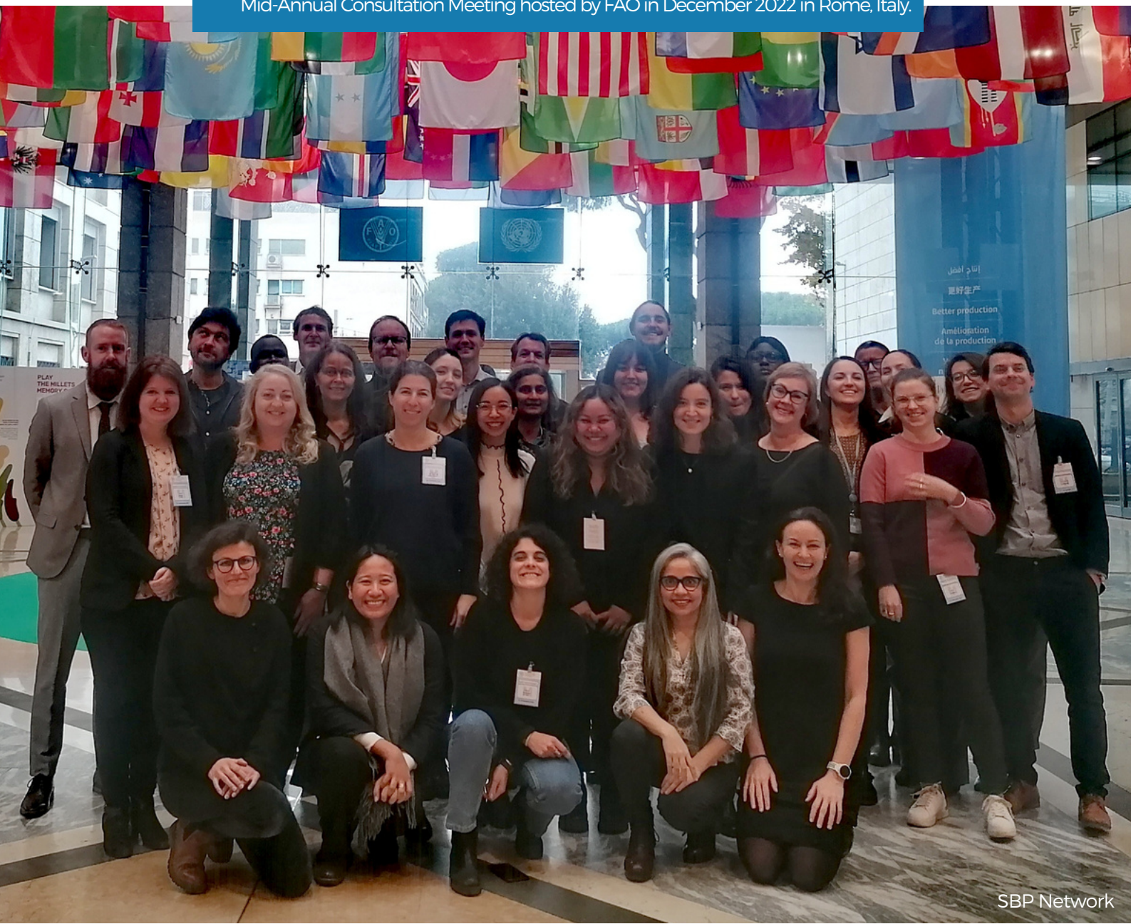
Mid-Annual Consultation Meeting hosted by FAO in December 2022 in Rome, Italy.